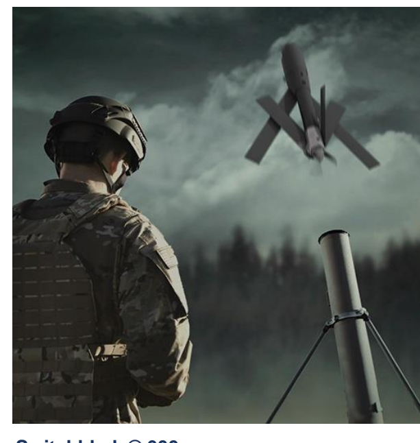
Switchblade® 600 24 Mile Range, 40 Minute Flight Time Patented wave-off and recommit

Emerging International Opportunities, Multi-Domain Applications, and Continued Core Product Leadership