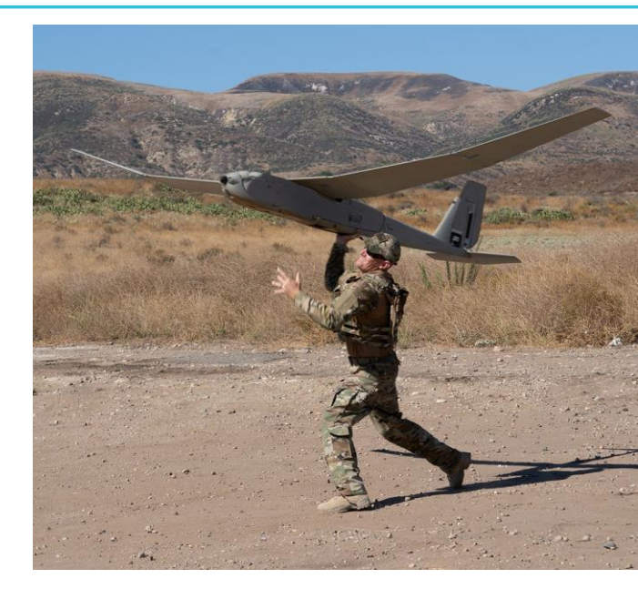
PUMA LE Up to 60km range and 6.5hr Flight Time Fixed Wing, Hand Launch

<sup>1</sup> Source: United States Department of Defense Unmanned Systems Roadmap 2013-2038, page 5